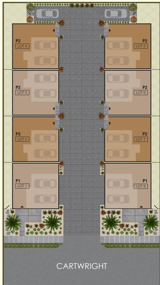
Map is not to scale. Subject to change without notice.